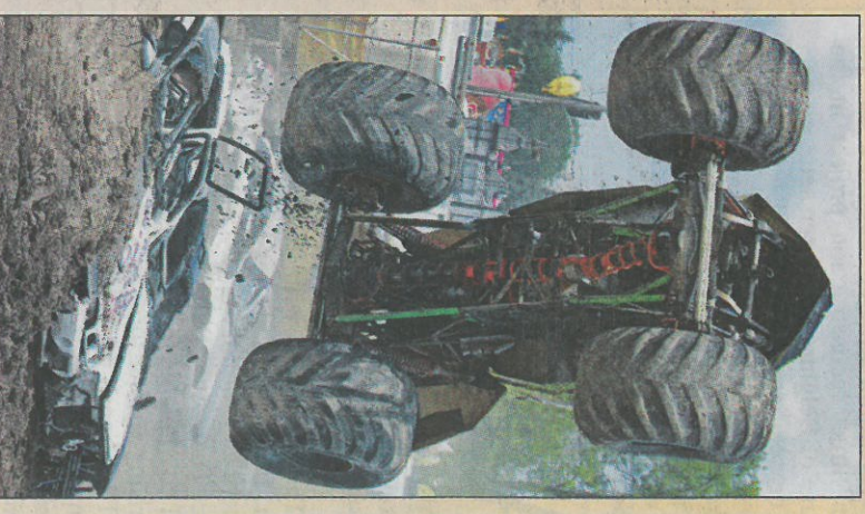
The county fair featured trucks big and small, like the monster truck that went airborne after crushing cars and the ones driven by youngsters competing in the children's demolition derby.