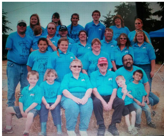
Breakfast on the Farm 2013 hosted by the Hamm Family

Ozaukee County Breakfast on the Farm Chairperson