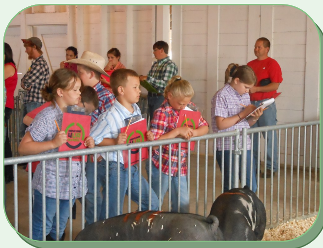
Judging breeding gilts