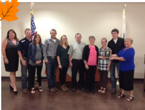
The Roden Family