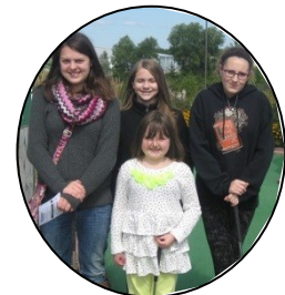
Last Place Team