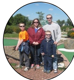
First Place Team