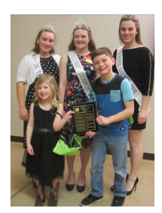
Younger Members dance off winners