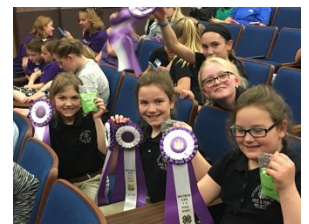
Sportsmanship Award Winners