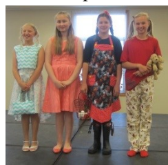
Junior Honor Court