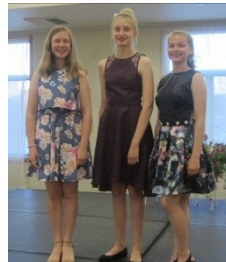
Senior Honor Court