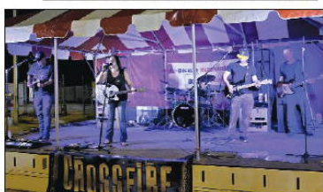
Crossfire performs at the Main Stage Thursday evening.