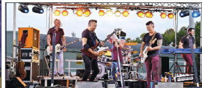
The crowd jams to the music of The Toys Thursday evening on the Centre Stage.