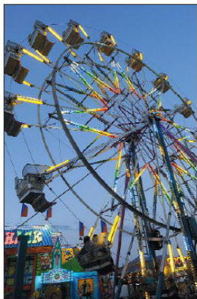
Carnival rides (above) and livestock (below) are an integral part of the Ozaukee County Fair.