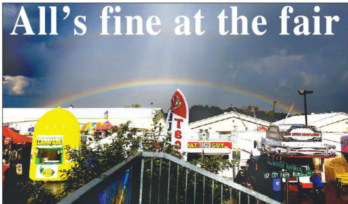
A rainbow appears as a good omen at the start of the Ozaukee County Fair Wednesday afternoon.