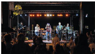
The Playlist was the closing band on the Centre Stage Thursday night.