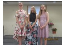
Senior Honor Court