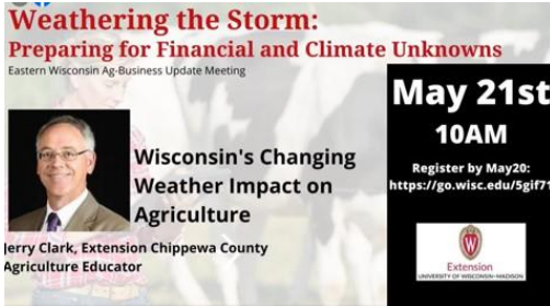
Weathering the Storm Webinar