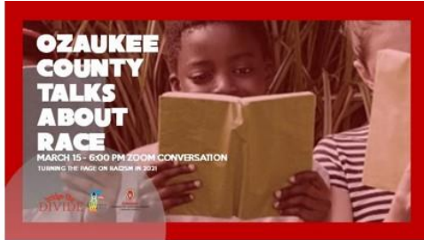
JCEP Conference – Seminar topic