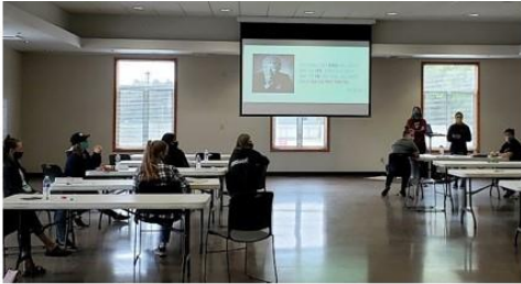
Photos from Camp Counselor Training