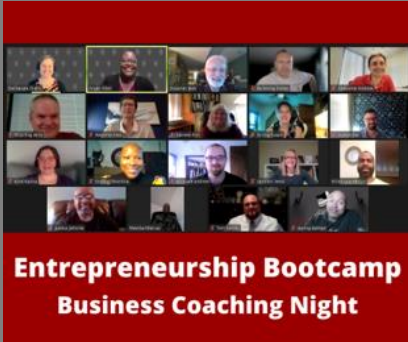
Entrepreneur in Training Bootcamp Coaching Night (computer screen image of participants)