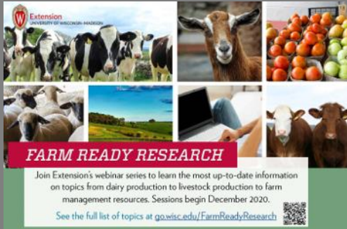
Farm Ready Research Promotional (photo collage of various farm animals)

“Thank you for all of the virtual programs you guys offered this year. Our family was able to participate in more programs this year than every other year combined. There always seems to be something that comes up whenever we wanted to attend one of the meetings in the past. Now we can watch the online programs from wherever we are.”