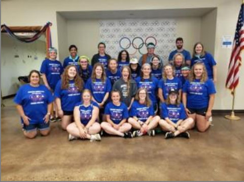
4-H Summer Day Camps Counselors (photo of group of youth camp counselors)

As a result of attending Ozaukee Summer 4-H Day Camps, 100% of surveyed respondents indicated that summer camp provided an opportunity to explore something they care about, they felt supported by other kids and adults at camp, were encouraged to be creative, and they felt safe and welcomed at 4-H Summer Camp. We heard repeatedly from this year's participants that they "cannot wait to do it again next year!"